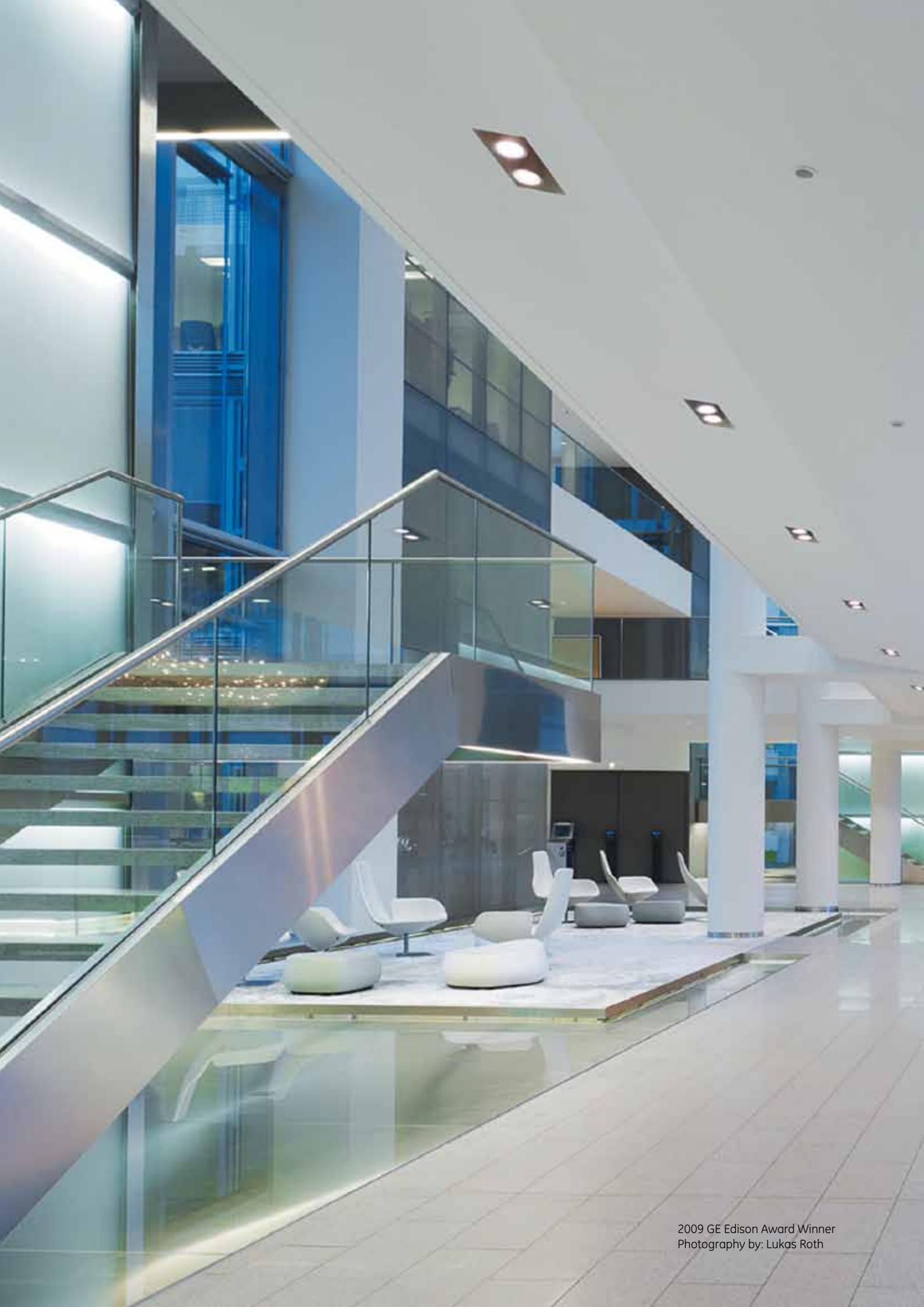
2009 GE Edison Award Winner